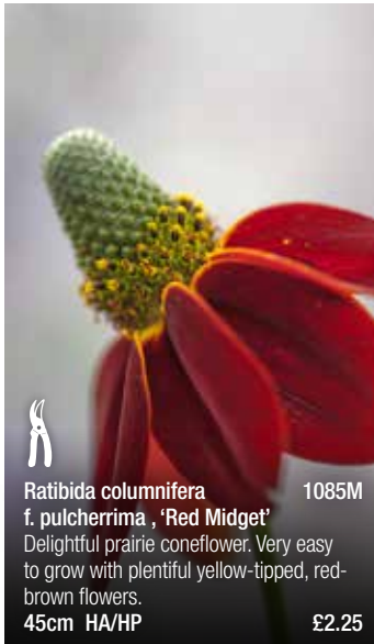
Ratibida columnifera f. pulcherrima, 'Red Midget' 1085M Delightful prairie coneflower. Very easy to grow with plentiful yellow-tipped, red-brown flowers. 45cm HA/HP £2.25

Top picks for easy to grow bright colours from seed? Cosmos practically grow themselves! I adore their feathery foliage which looks great both in the garden and in vases. I grow 'Fandango' , 'Rubenza' , 'Xsenia' and 'Cosmic Orange' every year. I'm also delighted to have taken a chance on Papaver rupifragum 'Orange Feathers' – sown direct last year, it flowered non-stop all summer, is perennial, and its leaves are evergreen too. I'm looking at them creeping across my decks border as I type!