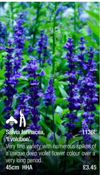
Salvia farinacea, 'Evolution' 1136L Very fine variety with numerous spikes of a unique deep violet flower colour over a very long period. 45cm HHA £3.45