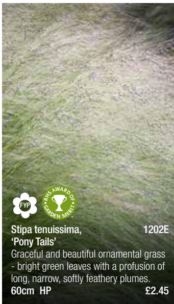
Stipa tenuissima, 'Pony Tails' 1202E Graceful and beautiful ornamental grass - bright green leaves with a profusion of long, narrow, softly feathery plumes. 60cm HP £2.45

How do you choose which colours each year? I make a shopping list of plants I'm drawn to and then mix and match using screenshots, looking not just at colour, but complementary or contrasting form and texture too. This year I'm beyond excited about Salvia 'Evolution' with its dramatic purple spires, and thought the feathery waves of Stipa 'Pony Tails' would make the perfect backdrop, offering secret hideaways for beneficial insects too. I couldn't resist adding Rudbeckia 'Cherry Brandy' into the mix with its warm-red, voluptuous horizontal blooms – a gorgeous textural contrast that both complements the colour scheme and benefits pollinators too.