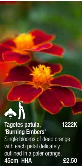
Tagetes patula, 'Burning Embers' 1222K Single blooms of deep orange with each petal delicately outlined in a paler orange. 45cm HHA £2.50