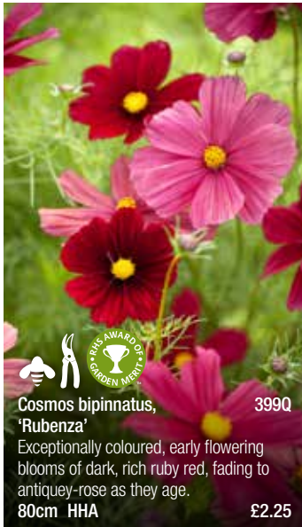
Cosmos bipinnatus, 'Rubenza' 399Q Exceptionally coloured, early flowering blooms of dark, rich ruby red, fading to antique-rose as they age. 80cm HHA £2.25