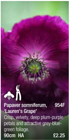
Papaver somniferum, 'Lauren's Grape' 954F Crisp, velvety, deep plum-purple petals and attractive grey-blue-green foliage. 90cm HA £2.25