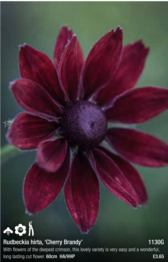
Rudbeckia hirta, 'Cherry Brandy' 1130G With flowers of the deepest crimson, this lovely variety is very easy and a wonderful, long lasting cut flower. 60cm HA/HHP £3.65

Top picks for easy to grow bright colours from seed? Cosmos practically grow themselves! I adore their feathery foliage which looks great both in the garden and in vases. I grow 'Fandango' , 'Rubenza' , 'Xsenia' and 'Cosmic Orange' every year. I'm also delighted to have taken a chance on Papaver rupifragum 'Orange Feathers' – sown direct last year, it flowered non-stop all summer, is perennial, and its leaves are evergreen too. I'm looking at them creeping across my decks border as I type!