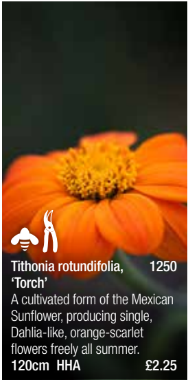
Tithonia rotundifolia, 'Torch' 1250 A cultivated form of the Mexican Sunflower, producing single, Dahlia-like, orange-scarlet flowers freely all summer. 120cm HHA £2.25