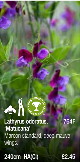
Lathyrus odoratus, 'Matucana' 764F Maroon standard, deep mauve wings. 240cm HA(Cl) £2.45