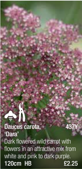
Daucus carota, 'Dara' 437Y Dark flowered wild carrot with flowers in an attractive mix from white and pink to dark purple. 120cm HB £2.25