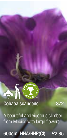
Cobaea scandens 372 A beautiful and vigorous climber from Mexico with large flowers. 600cm HHA/HHP(Cl) £2.85