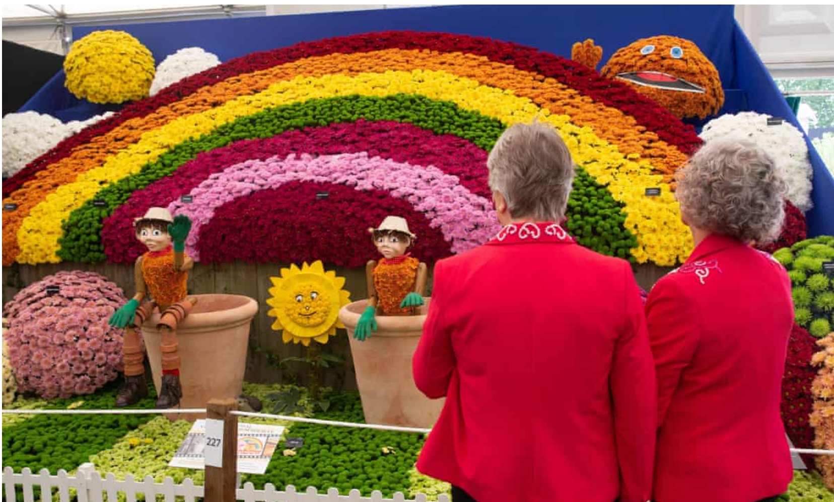
▲ Gardeners will be denied the colourful displays of last year's RHS Chelsea Flower Show for the first time since 1913.

As lockdown forces us to use every inch inside our homes, those lucky enough to have outside space are going al-fresco