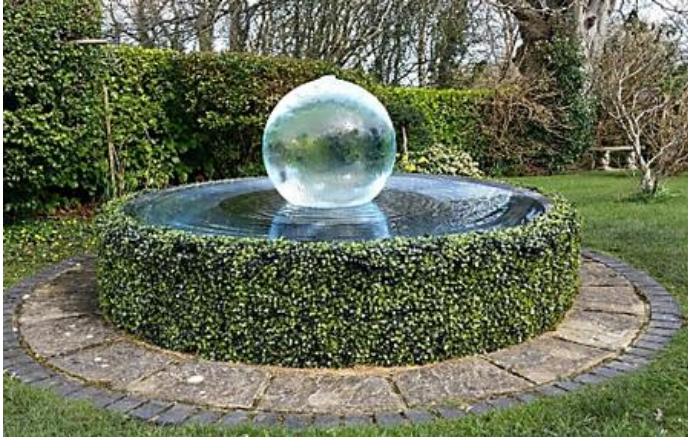
Aqua Globe Spherical Water Features