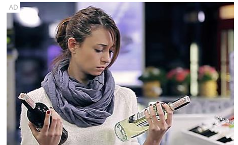
Why You Should Stop Drinking £5 Supermarket Wine Naked Wines