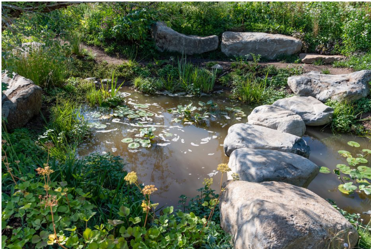
Countryfiles 30th Anniversary Garden. Designed by: Ann-Marie Powell. Feature Garden. RHS Hampton Court Palace Flower Show 2018. Stand no. 518

"It is both an honour and a joy to create this wonderful garden for Countryfile at one of the biggest and most famous gardening events in the world. I've loved researching and being inspired by Britain's amazing landscapes whilst creating my design."