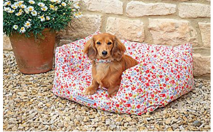
Shopping: Presents for your pets