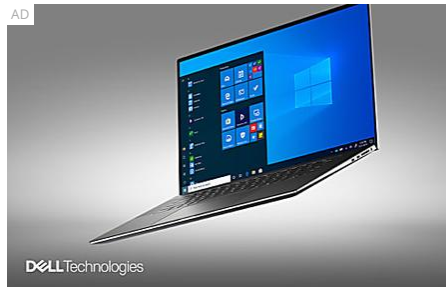
The world's smallest and most intelligent 17" workstation - meet the Dell Precision 5750. Learn more Dell