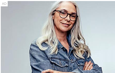
5 Reasons Over 60s Should Release Equity Telegraph Equity Release