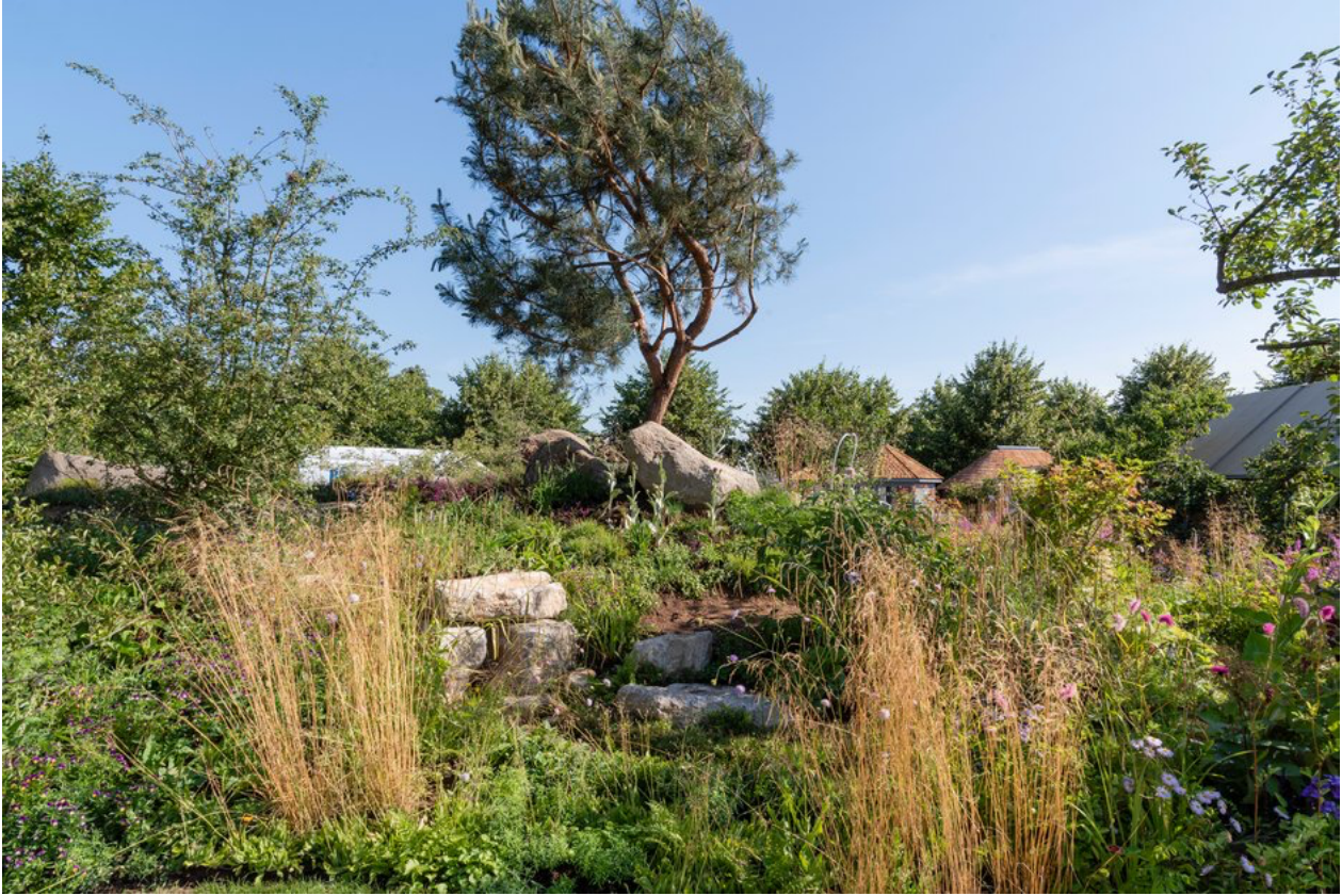
Countryfile's 30th Anniversary Garden designed by Ann-Marie Powell.

For the Scottish highlands there will be a rugged landscape of Gabbro boulders, Scot's pine, Vaccinium myrtillus (blaeberry) and heathers. The dales and moors will also be a rocky landscape, with an abundance of Crataegus (hawthorn), rock rose Helianthemum nummularium and wild thyme among weathered limestone.