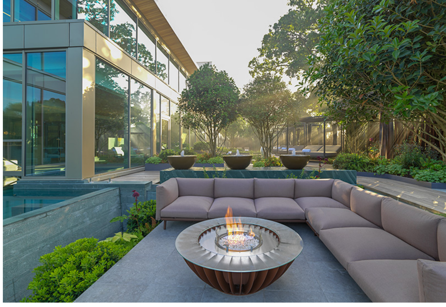
The Club at Cottonmill

The product of a £14 million, much-thought out renovation, this Hertfordshire haven, based at Sopwell House (within easy reach of St Albans), proudly proclaims itself as the UK’s first private members’ spa. It comprises two options: Cottonmill, which gives hotel and spa guests access to an indoor swimming pool, steam room, sauna, salon, treatment rooms and state-of-the-art gym.