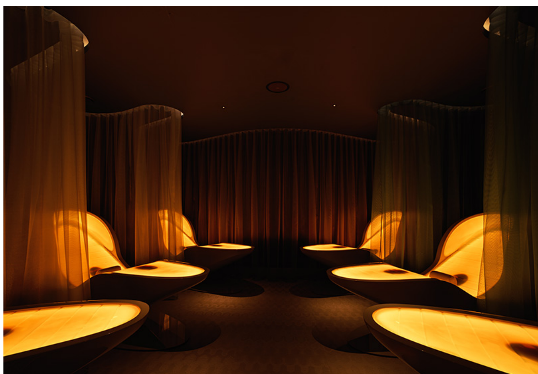
The Club at Cottonmill

There’s an exhaustive menu of treatments to try out too, including exclusive Elemis experiences designed around the healing properties of sand and water as well as those from ESPA and Aromatherapy Associates. On the Amber and Quartz Crystal bed – the first in a UK spa – warm crystals mould to your body, helping to ease muscle tension during massage, while in the water-based offerings, a Vichy shower directs water at different pressure points on the body.