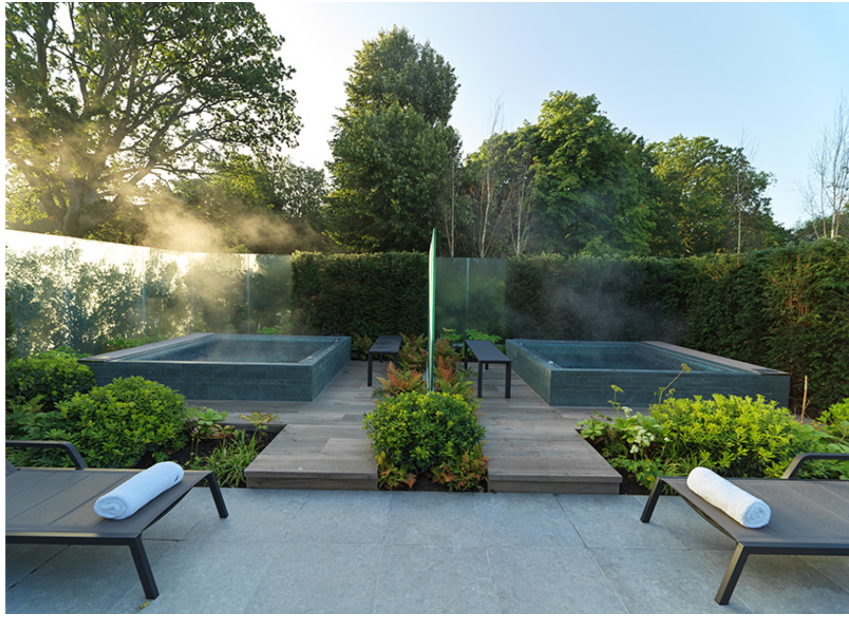
The Club at Cottonmill