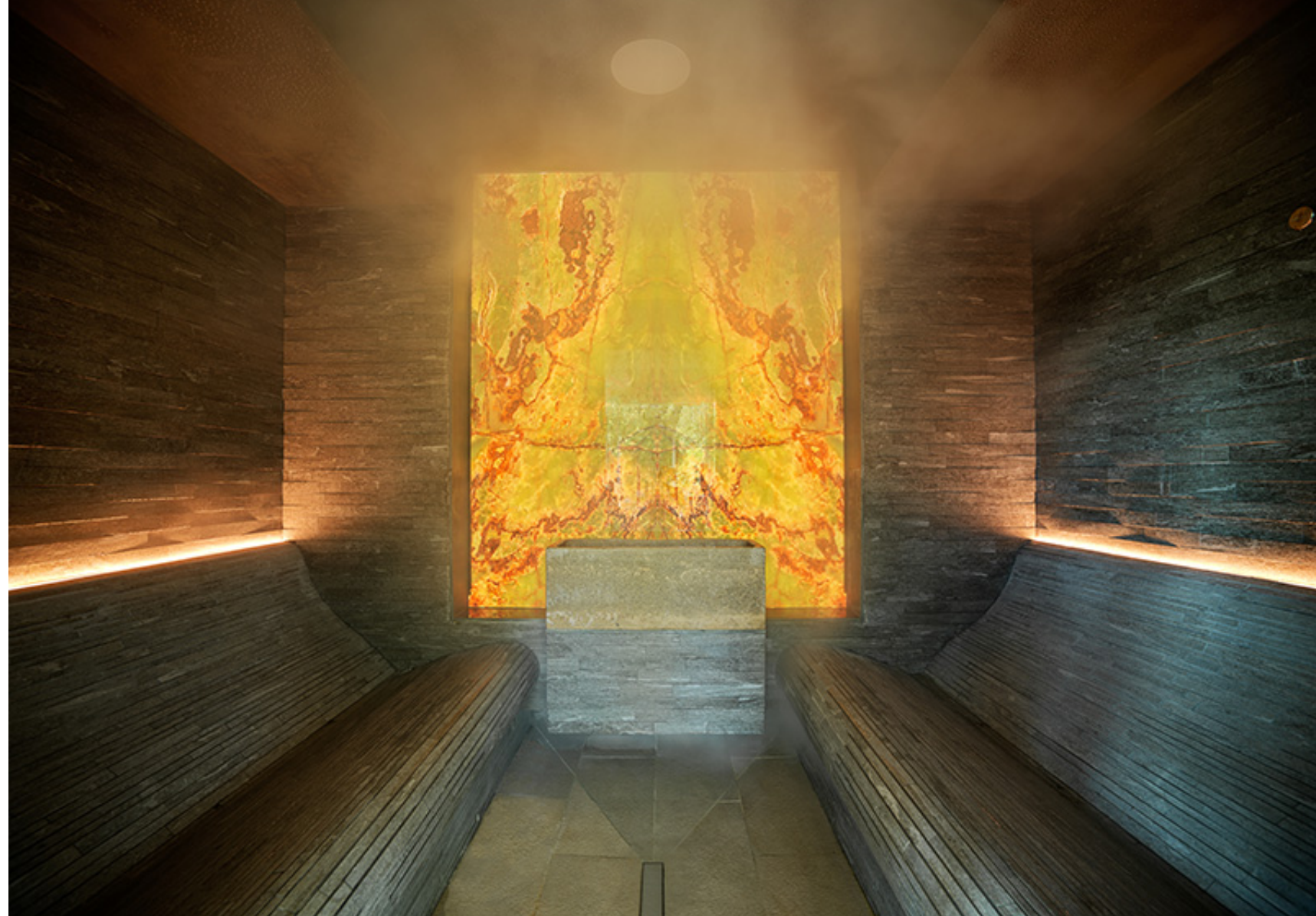
The Club at Cottonmill

Every detail is thought of – there’s piles of thick towels nearby the ginormous day beds, just in case yours has got too damp, while attentive staff hover discreetly, on hand to bring a prosecco to one of the outdoor hot tubs scattered across the garden should you wish.