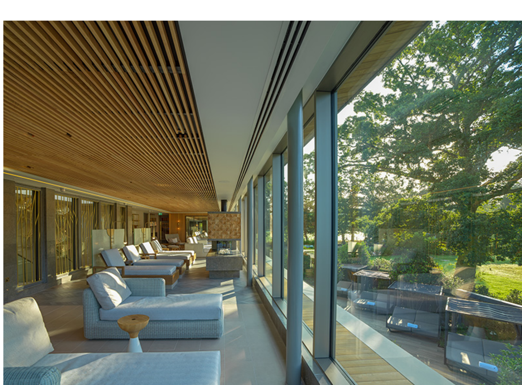
The Club at Cottonmill

Of course, you might find yourself so relaxed that getting home isn’t an option. We stayed in one of the 16 Mews Suites within the grounds of Sopwell set in the beautifully landscaped gardens, and dined at the hotel’s restaurant. Food was elegantly classic – think pork belly and pate starters, followed by monkfish or lamb.